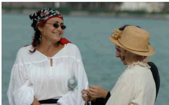
Santa Lucia Day photos (continued from cover)